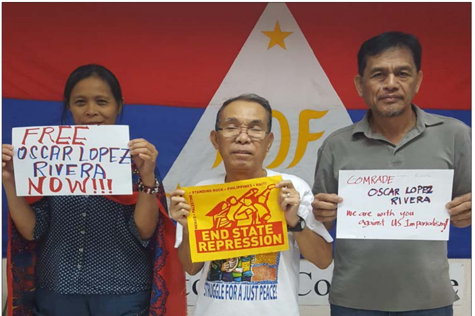
Philippines - supporting Oscar