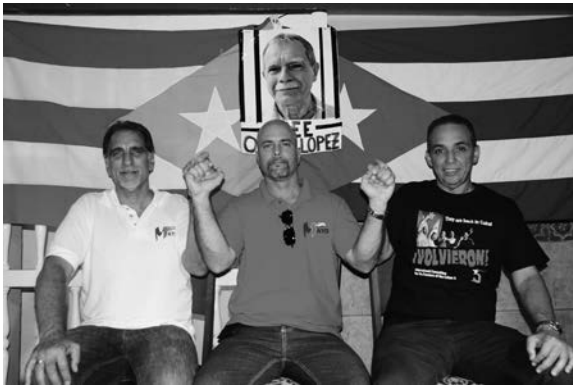
3 of the Cuban 5 - René González, Gerardo Hernández & Antonio Guerrero