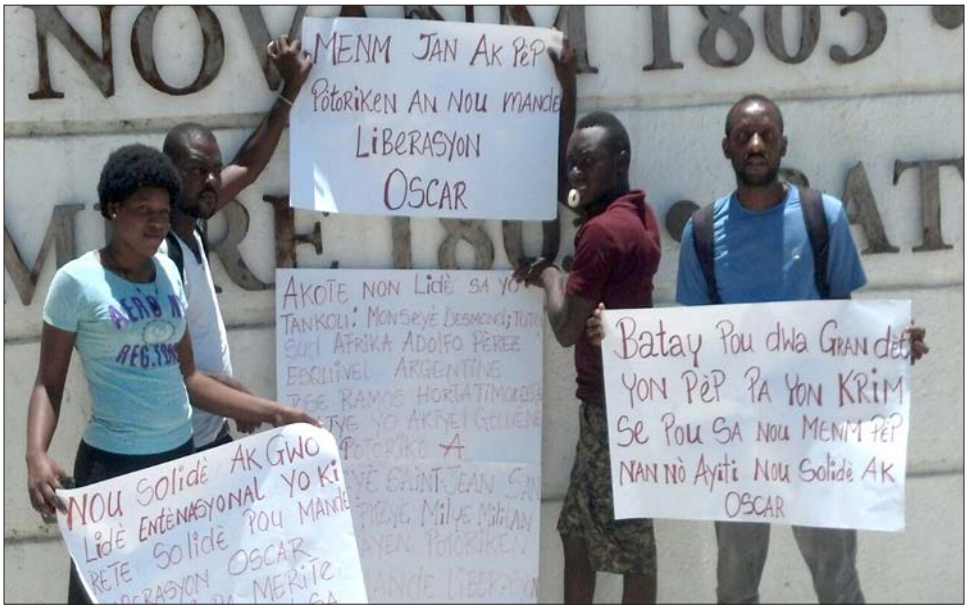
Haiti - supporting Oscar