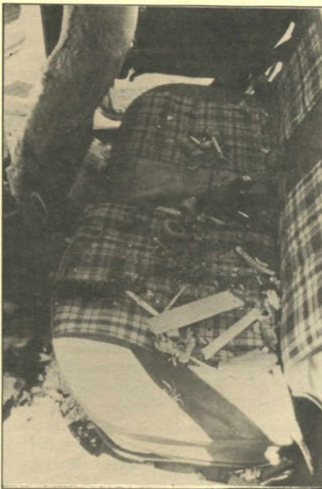
Police photo shows the undamaged back seat just after the blast, disproving the FBI's claim that the bomb was in the back.