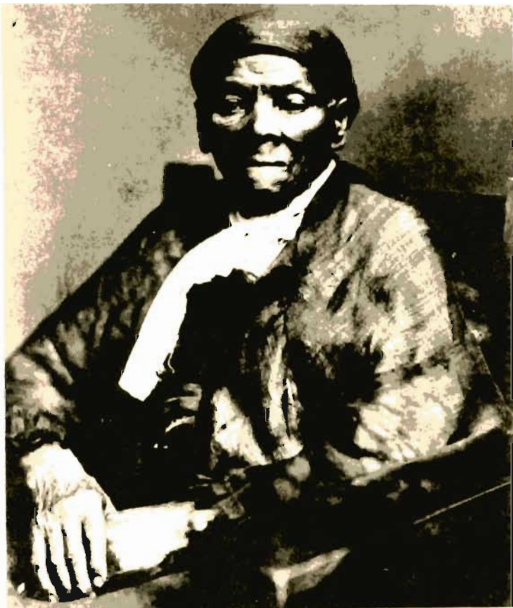
Harriet Tubman, best-known "conductor" of the Underground Railroad, guided slaves as far north as Canada to gain their freedom.

... women who had sucking children suffered much from their breasts becoming full of milk, the infants' being left at home; they therefore could not keep up with the other hands: I have seen the overseer beat them with raw hide so that the blood and the milk flew mingled from their breasts. 9