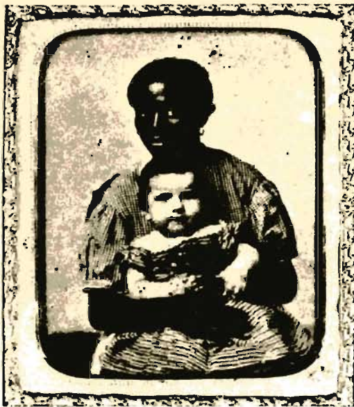
Slave and Friend

“All the Pretty Little Horses” is an authentic slave lullaby; it reveals the bitter feelings of Negro mothers who had to watch over their white charges while neglecting their own children.