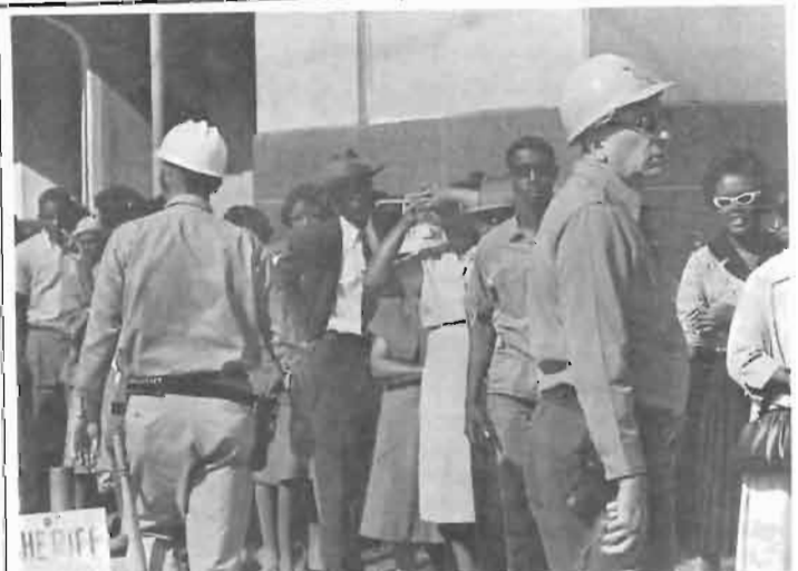
SELMA Negroes line up to register to vote.

Two others, 14-year-old Sallie Mae Durham and 19-year-old CONTINUED TO PAGE 2