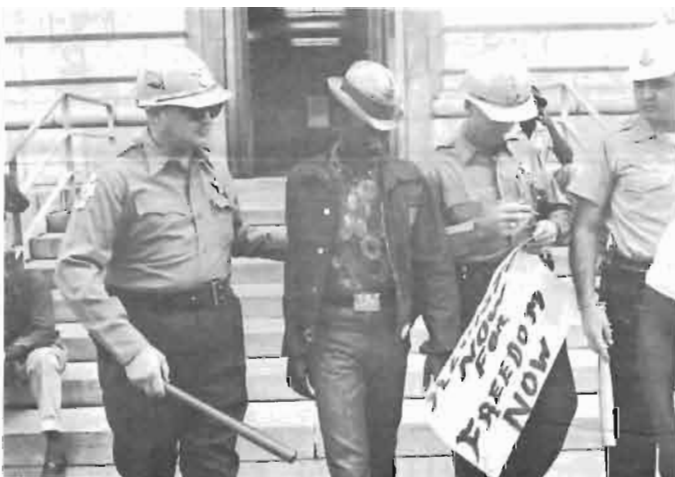
SELMA, ALABAMA policemen arrest two voter registration workers on the steps of the Federal Building there. Several movement workers have been jailed by policemen here while encouraging Negroes to register to vote.

Now SNCC workers and others who have been active in the drive here have been summoned to appear before a November 13 Grand Jury. The Jury meets one day before other SNCC