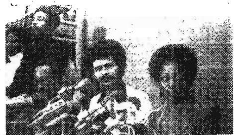
Chokwe with Fulani Sunni-Ali

Subscribe to CROSSROAD! Still a Steal at $5/6 issues $10/organizations & libraries $15/international