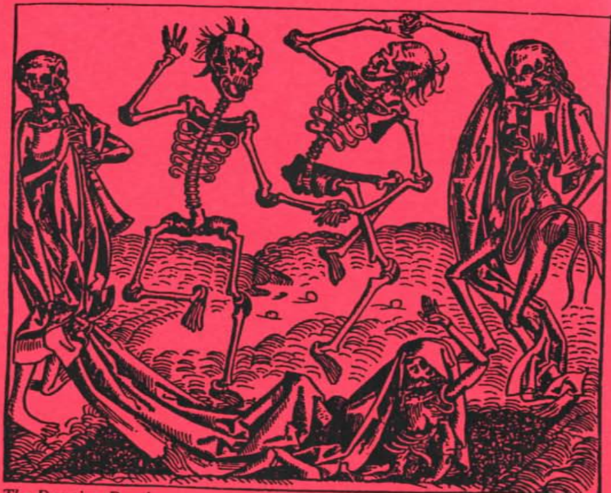
The Dancing Deaths.